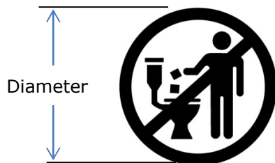
'Do Not Flush' symbol

Packaging for non-flushable products that have a potential to be flushed must clearly indicate that the product should not be disposed of via the toilet by displaying the 'Do Not Flush' (DNF) symbol. The additional use of the 'Dispose via the Solid Waste Stream' ('Tidy Man') symbol to confirm disposal via the solid waste system is discretionary; where used, it is recommended to be the same size as the DNF symbol.